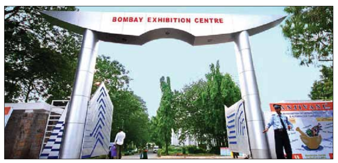
Bombay Convention & Exhibition Centre (BCEC) has hosted several prestigious International Trade Fairs / Exhibitions ever since 1991.